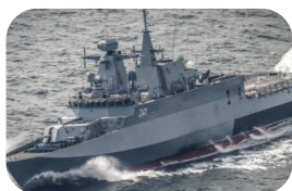
Aerospace, Defense, & Government Services