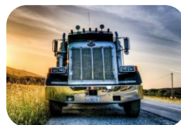
Transportation, Logistics, & Distribution