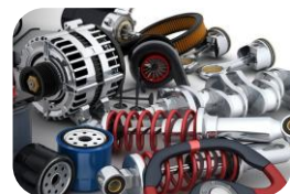
Manufacturing, Industrial, Automotive