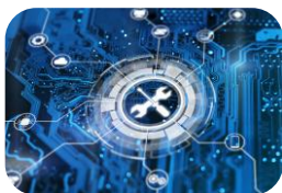
Business & Industrial Services